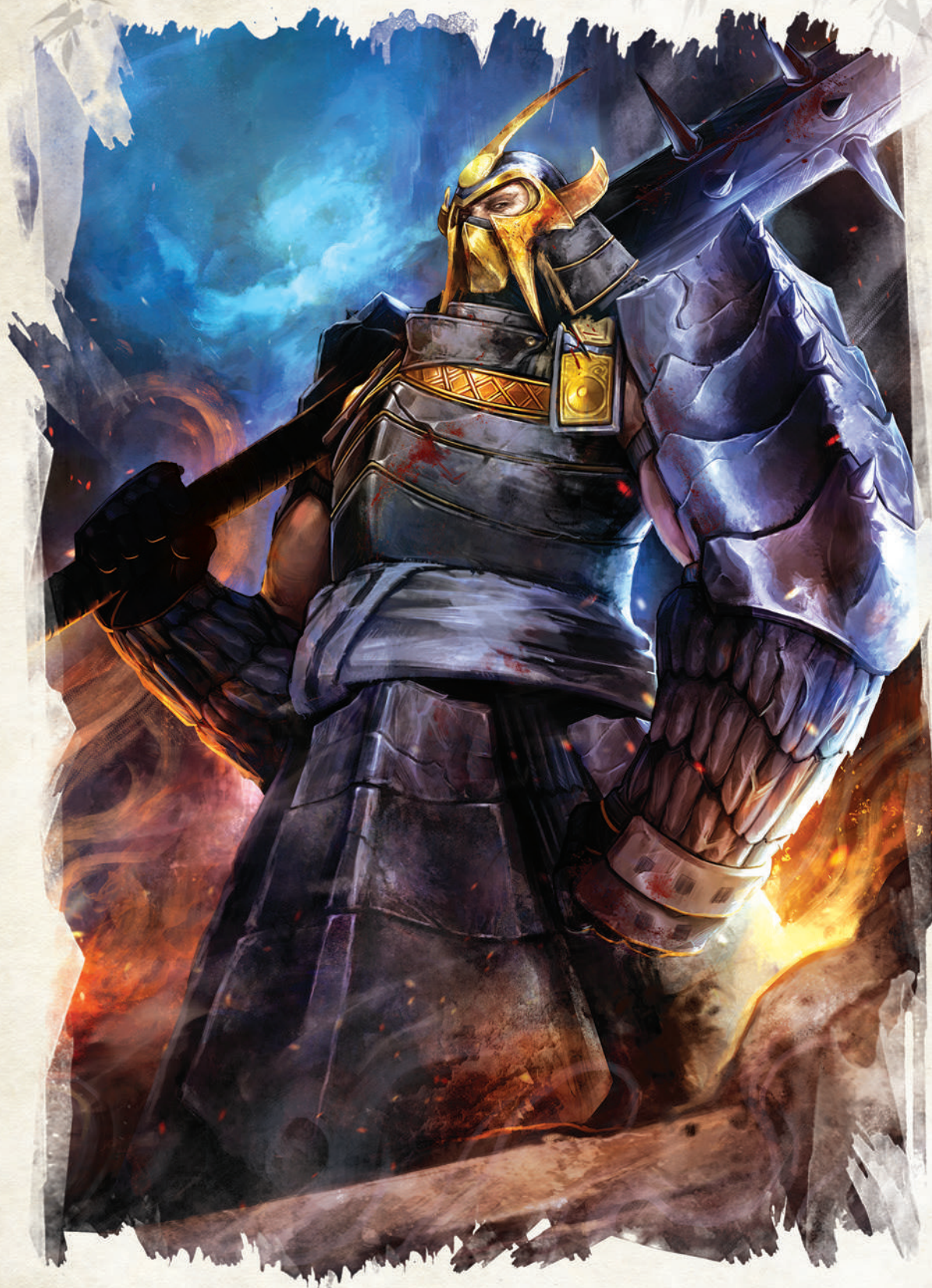
Hida Kisada - Unyielding Champion of the Crab Clan