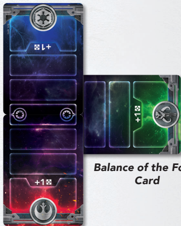
Balance of the Force Card