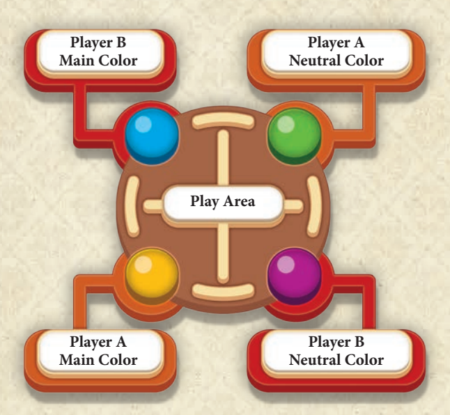
2-Player Seating Arrangement

5. Choose Colors and Arrange Seating: The players sit next to each other. Each player chooses one color to be his MAIN COLOR and the other to be his NEUTRAL COLOR. He takes the nine character cards of both colors and all the plastic astronauts of both colors. He places the components of his main color in front of him and the components of his neutral color across from him (see diagram below).