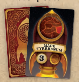
36 Ship Cards