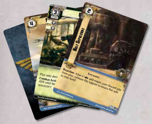
222 Player Cards, 2 Player Reference Cards

The various components in the game are presented here as a reference for identification purposes.