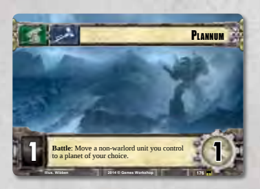
10 Planet Cards