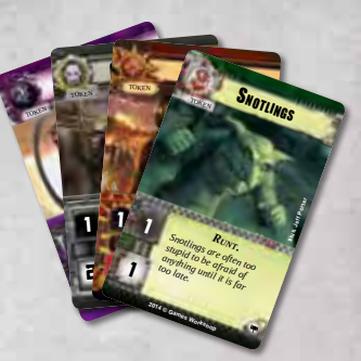
40 Token Cards