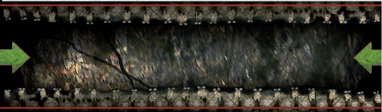
The Secret Chamber