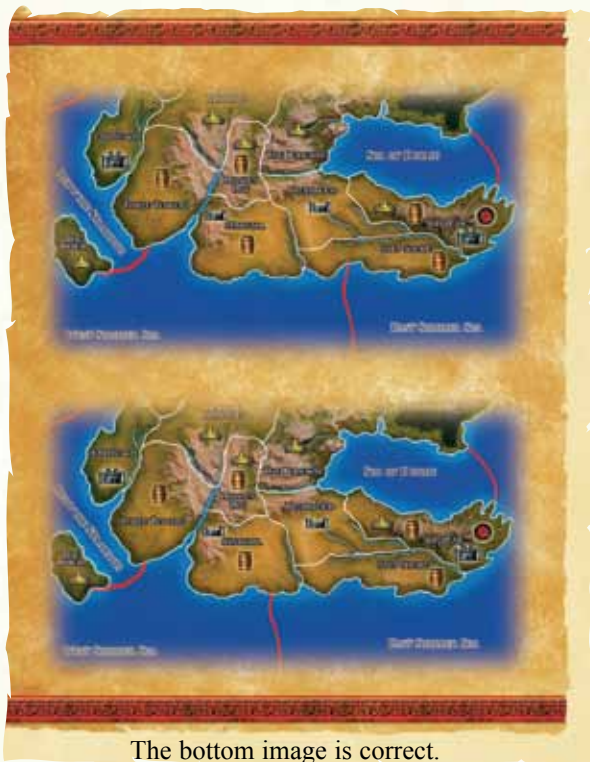
The bottom image is correct.

In some printings of the Clash of Kings expansion, the border separating the West Summer Sea and the East Summer Sea is misplaced. The border should extend from Starfall, not Salt Shore.